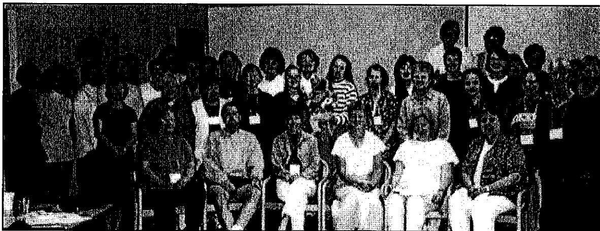
1999 Family Literacy Summer Institute Best Practices Forum Participants