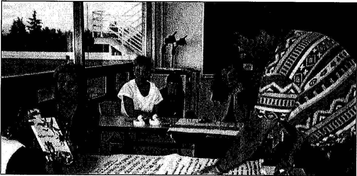
1999 Family Literacy Summer Institute workshop participants